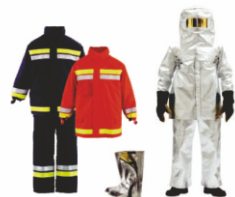
Nomex & Aluminized Fire Suits