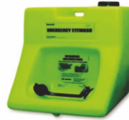
Portable Eye Wash & Eye Saline