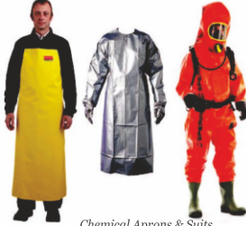
Chemical Aprons & Suits