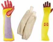
Kevlar / Cotton Arm Sleeves

Chemical Resistant Gloves: Nitrile / Butyl / Neoprene / PVC