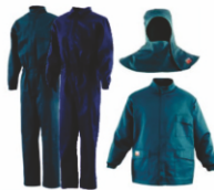
Flame Retardant Garment