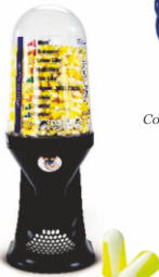
Ear Plug Dispenser